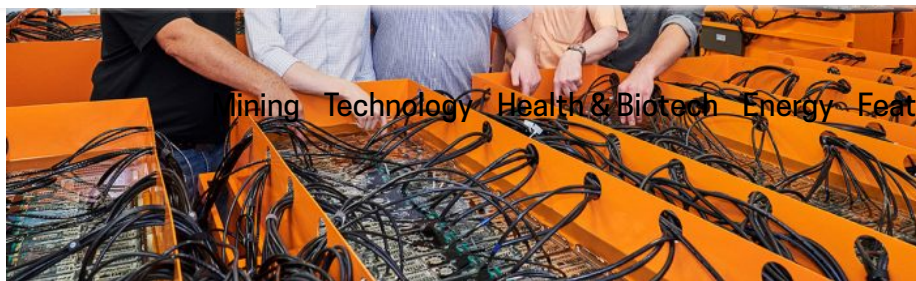
DUG technology's Perth-based super computer

In addition to its Perth headquarters, DUG has processing centres in Kuala Lumpur, London and Houston.