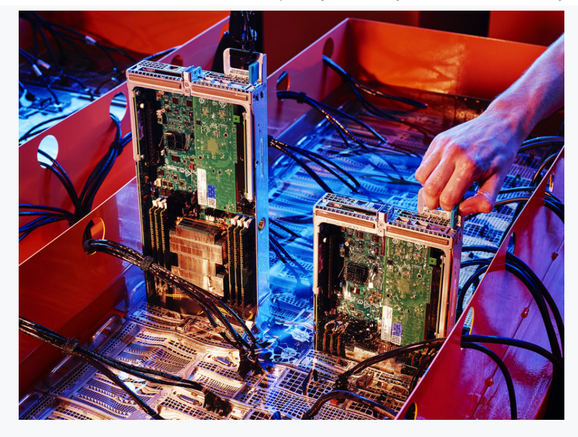
The huge application speedup was the result of DUG's HPCaaS. Seen here in DUG's immersion-cooled tanks located in West Perth.