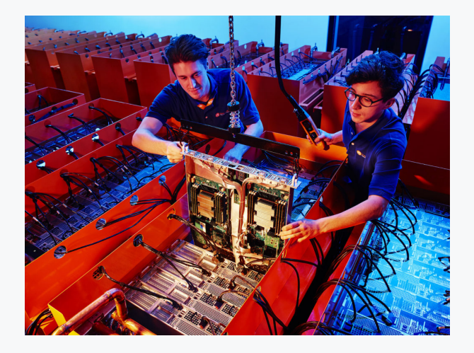
The huge application speedup was the result of DUG's HPCaaS. Seen here in DUG's immersion-cooled tanks located in West Perth.

The data was transferred to DUG's supercomputer in West Perth, where their software engineering team optimised the processing algorithms and delivered the processed data in record time.